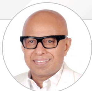
KABIR AHMED CONVEYOR LOGISTICS LTD. BANGLADESH www.conveyor.com.bd