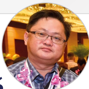
GAN CHOW SIN GNS FREIGHT SYSTEM SDN BHD MALAYSIA | www.gnsftr.com