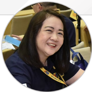
ARLENE C. PARSAD MEISTER TRANSPORT, INC. PHILIPPINES www.meister.com.ph