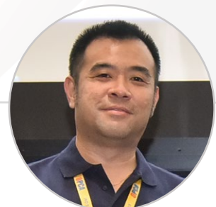
WANG CHAN HUI GREENPEN FREIGHT SERVICES SDN BHD MALAYSIA www.greenpenfreight.com.my